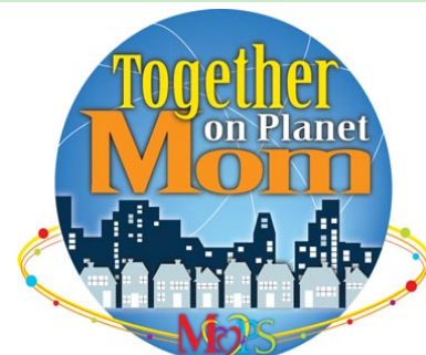
“Where two or three come together ... there I am with them.” Matthew 18:20